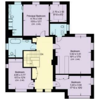
First Floor Approximate Area = 152.3 sq m / 1639 sq ft Including Limited Use Area (4.5 sq m / 48 sq ft)

Surveyed and drawn in accordance with the International property measurements standards (IPMS 2: Residential) Not drawn to scale unless stated. Whilst every care is taken in the preparation of this plan, please check all dimensions, shapes and compass bearings before making any decisions reliant upon them.