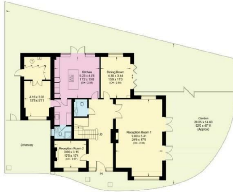
Ground Floor Approximate Area = 176.8 sq m / 1924 sq ft Including Limited Use Area (3.7 sq m / 40 sq ft)